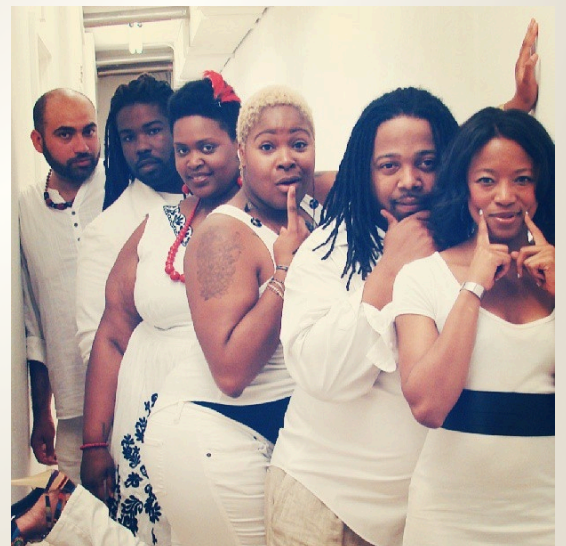
MoonCandy Live House Ensemble Project